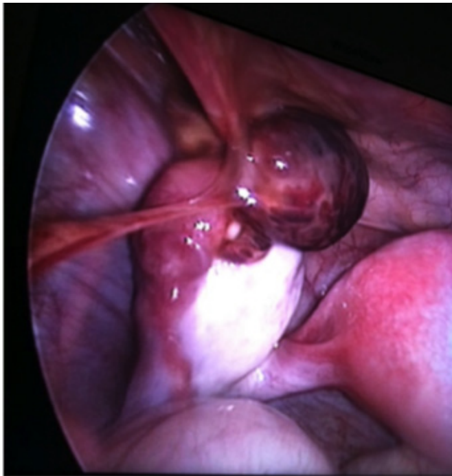
Figure 2: The laparoscopic view of left ovarian pregnancy. The tube is intact and the mass is adjacent to the ovary.