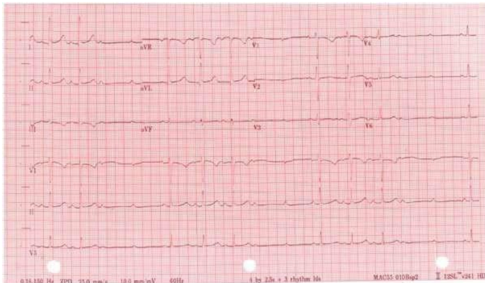
Figure 2: EKG during admission.