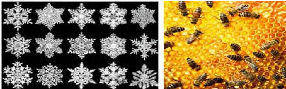
Figure 3: Ingeneza controls snowflake development and honeycomb construction ( W. A. Bentley and W. J. Humphrey Dower, Publications 1962)

The electric field in the human biological system is the carrier of solitons, which contain the primary information called "ingeneza". Ingeneza programs are quantized and create all stages of development, cell, organism, biosphere and cosmos. Water molecules are also carriers of this information (Figure 3).